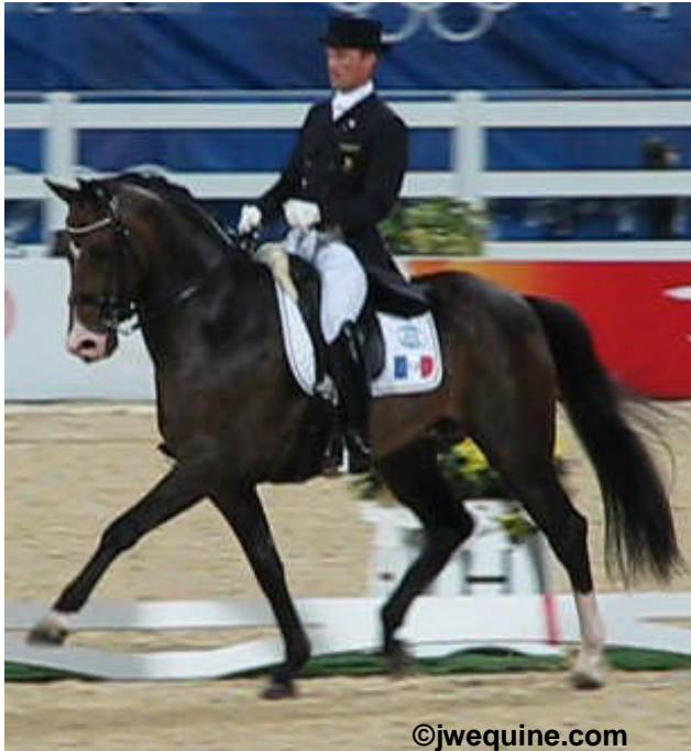
WHIINI STAR (by Pik Solo) – 2008 Olympics