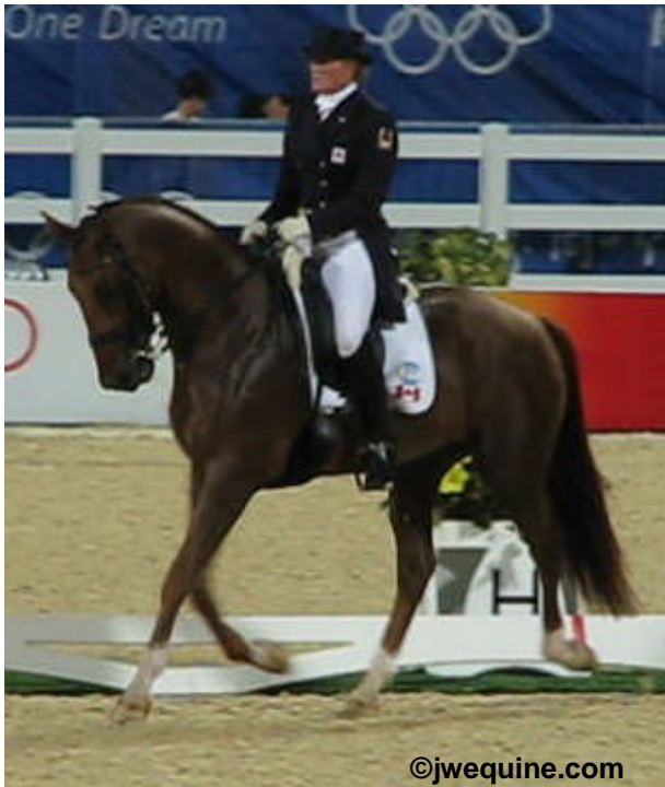
ORION (by Jazz) - 2008 Olympics