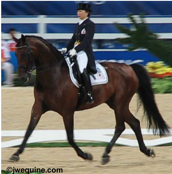
DOW JONES