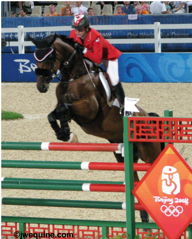
SPECIAL ED – Team Silver 2008 Olympics