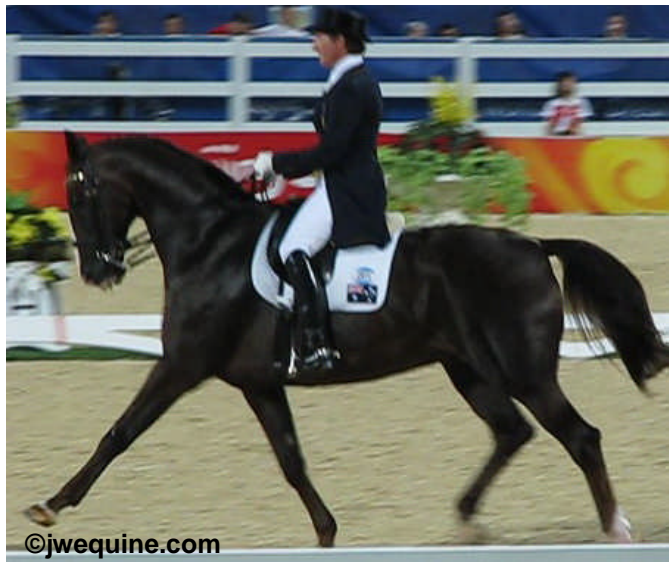
GREENOAKS DUNDEE (by Duntroon)