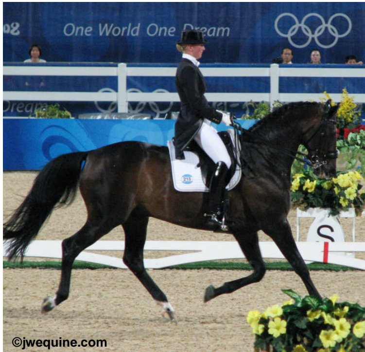
DIGBY (by Donnerhall)